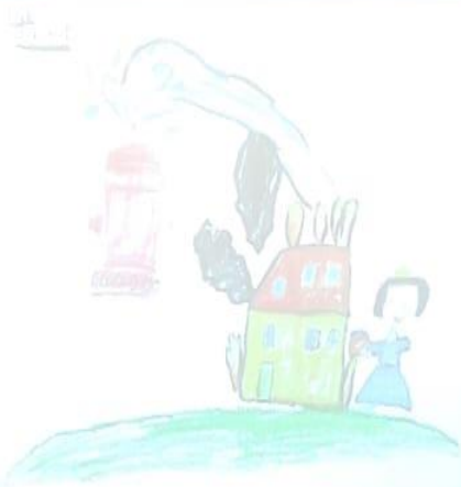
Consolation 4) S.Yaazhini IIIA AECS-2