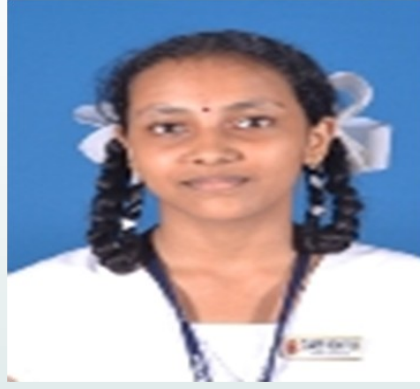
II—INITHA M 560/600(93.3%)