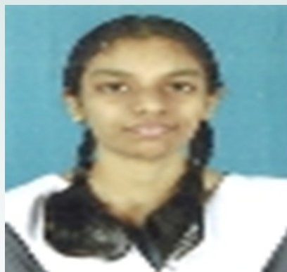
II — JANANI SS 479/600(79.8%)