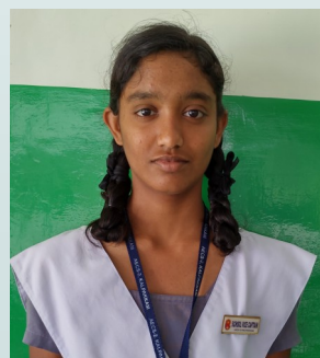
V A PRAGALPHA