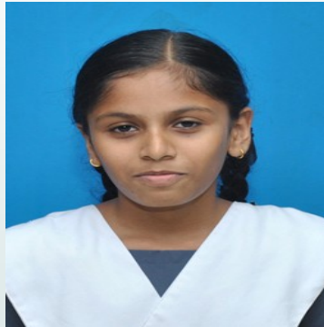
II—MEDHA D 483/500(96.6%)