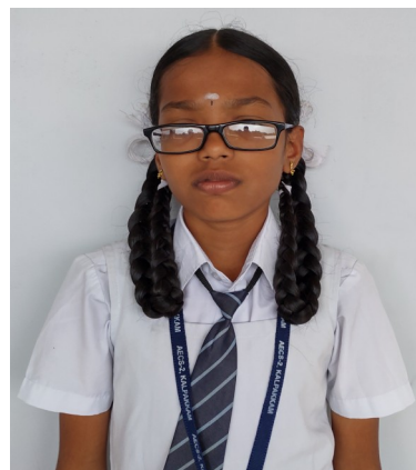
Saipriya VII B