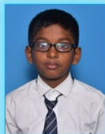
YAKKASH S III A